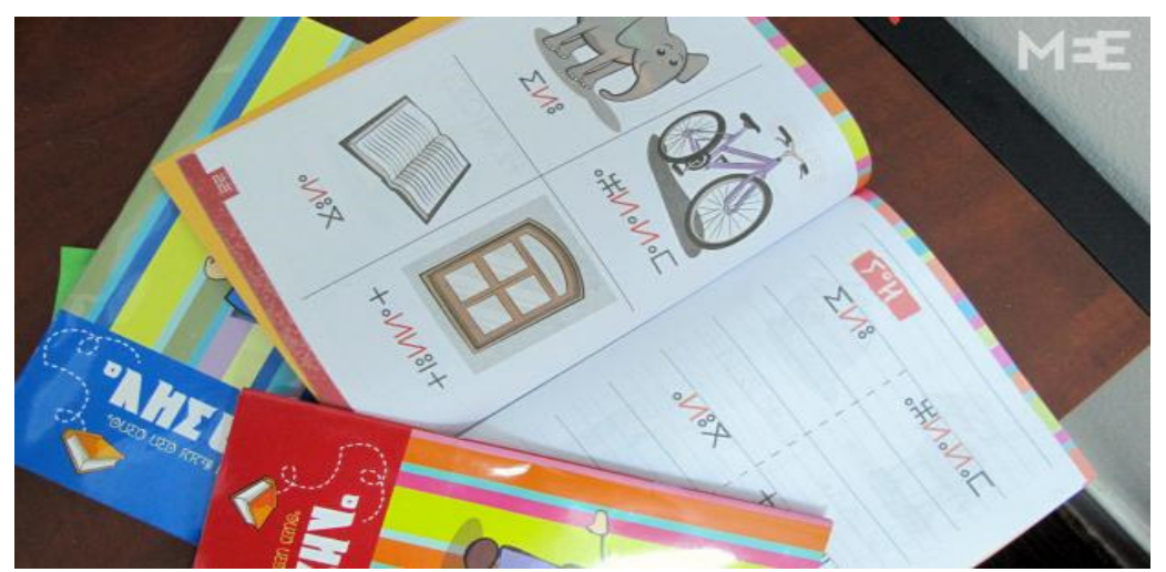
"2" The new books teaching the Amazigh children a language that they previously would not have been allowed to learn outside their homes.<sup>1</sup>