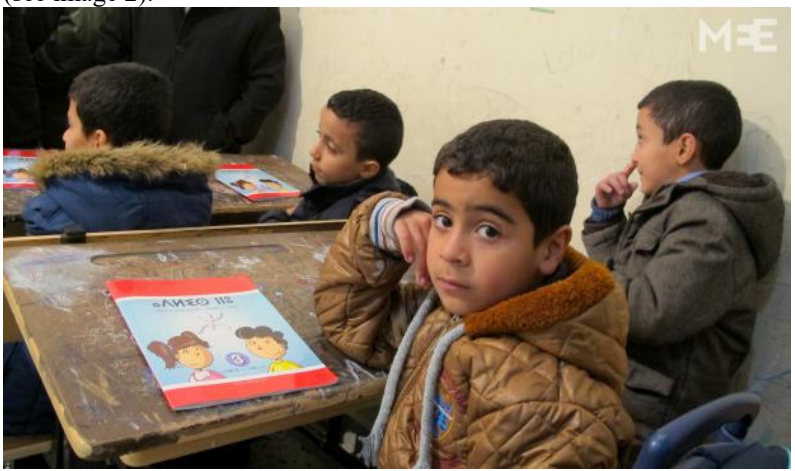
"1" Tamazight class 4

The Tamazight classes (see image 1) started at schools in 2013. It is written in Tifinagh, the Amazigh script (see image 2).