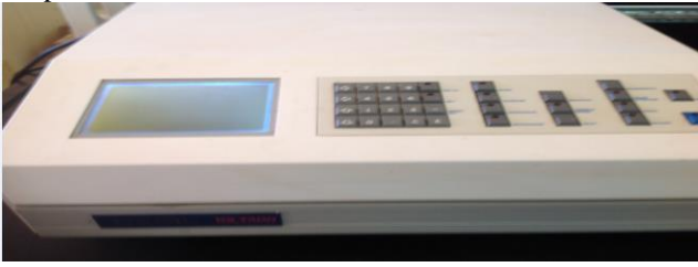
Figure 2: Shows photograph of CE7400-7000 3ERIES Double Beam spectrometer

Beam UV-vis spectrophotometer manufacture Buck scientific, Inc. The scan distance range was between 200-800 nm (fig.2.). The spectra was recorded at room temperature.