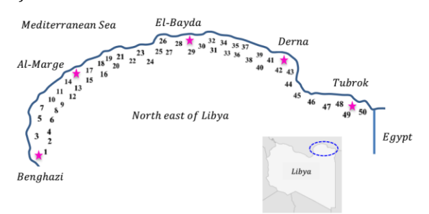
Fig. 1 . Shows the sites of collected samples in the area extended from Benghazi city to the Libyan-Egyptian borders

Industry and all form of life on earth have been unavoidably exposed to radiation from all kind of sources. Exposer to natural sources vary little from year to year and involves the whole world population to almost the same extent. The exposure dose from natural sources depends mainly on the place of residence, and altitude. For most world population, the range of individual effective dose from natural sources is between one-half and two times the average global value at sea level which is 2.4 mSv per year (UNSCEAR, 1988).