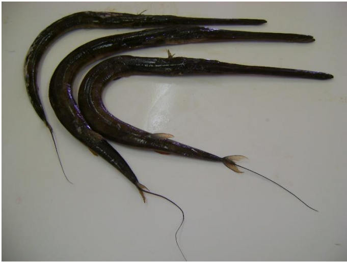
Fig. 1. Samples of the blue spotted cornetfish, Fistularia commersonii .

contents within the digestive tract was done by recording the degree of stomach fullness. The stomachs were classified as gorged, full, three-quarter full, half full, quarter full, trace and empty depends upon the degree of fullness and consequently, the amount of food contained in them converted to a percentage (Bapal and Bal, 1958).