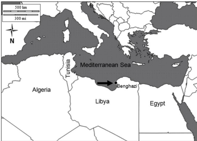
Fig. 2. Map showing the location of sampling F. commersonii in the coast of Benghazi, Libya.

The condition factor (K) was calculated according to Pauly, 1983 by the formula: