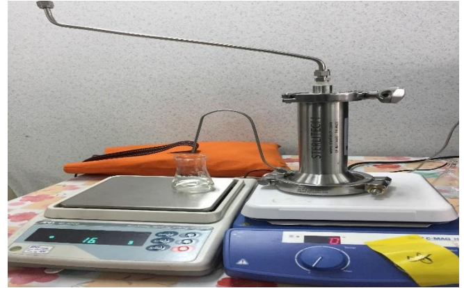
Figure 3. The dead-end permeation cell.

The higher FRR value obtained, the better antifouling ability and higher washing efficiency are possessed by the membrane.